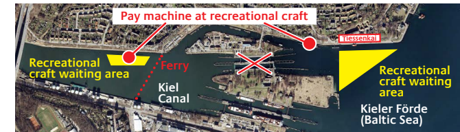
KIEL-HOLTENAU LOCK: Please use the big locks. The small locks are out of service for a longer period of time.