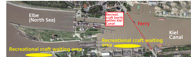
BRUNSBÜTTEL LOCK: Please use the small locks.