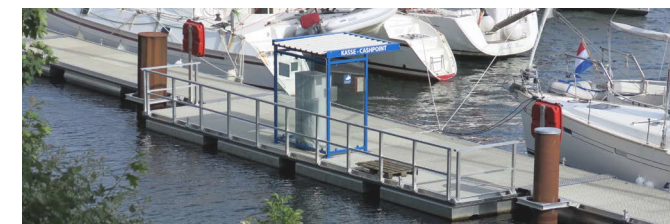
Pay machine at recreational craft landing stages, waiting area Kiel-Canal north