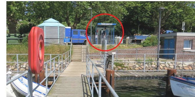
Pay machine at recreational craft berth west of Tiessenkai, Kiel-Holtenau and Port Warden at Kiel-Holtenau Tiessenkai