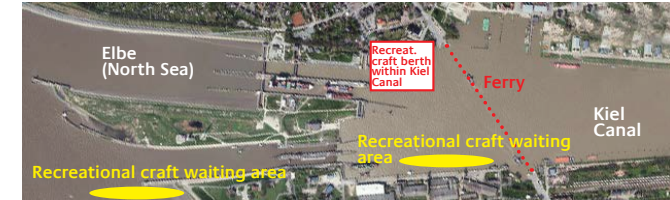
BRUNSBÜTTEL LOCK: Please use the small locks.